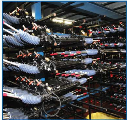
Remanufactured Power Steering Racks Ready To Go